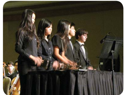
YSI percussionists mimicked Irish stepdancing for an arrangement of "The Lord of the Dance," with shoes and a sturdy tabletop.