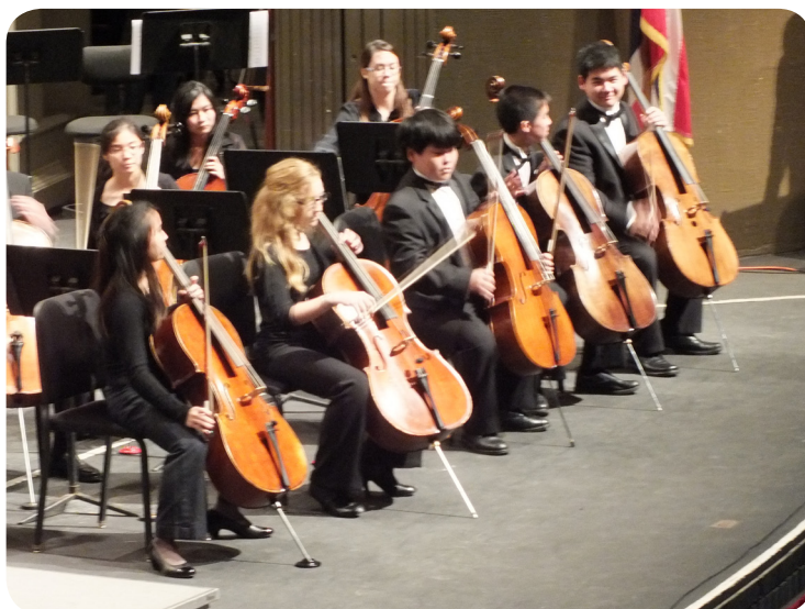
Cellists from YSII showing off their graceful and playful instruments