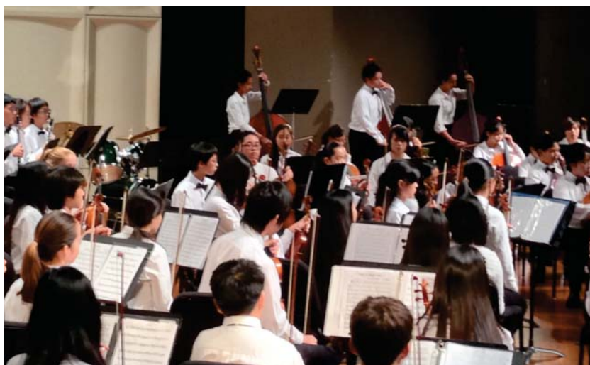
Concert Orchestra strings performing Bach's Fantasy on 'Sleepers, Wake' at the "Bach to the Future" Winter Concert