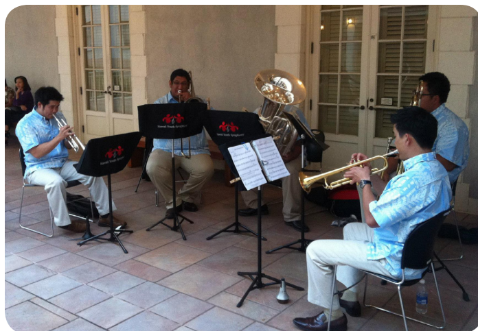
The Ahuawa Brass Quintet