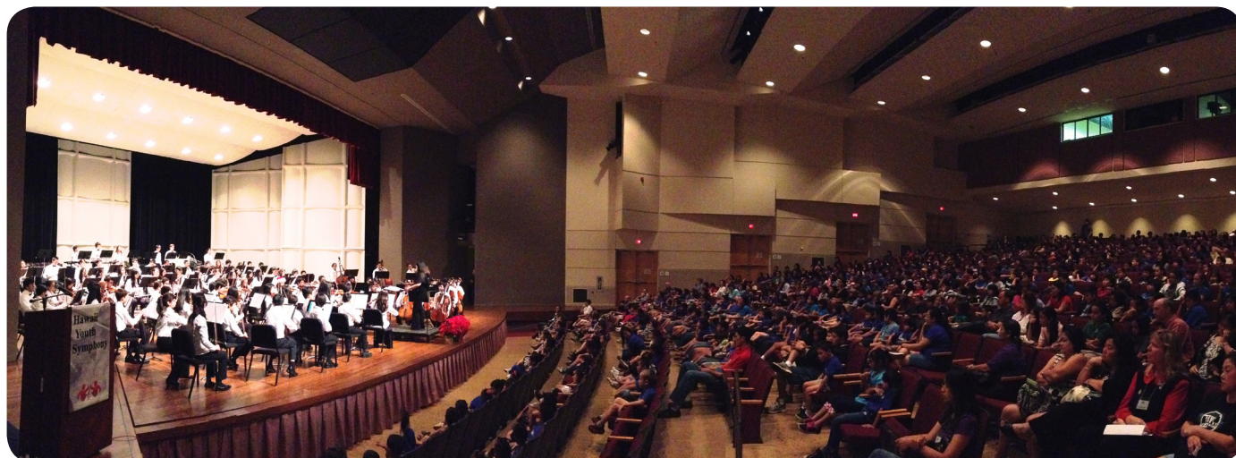
Concert Orchestra performed for 1,300 children at Pearl City Cultural Center back in December 2012