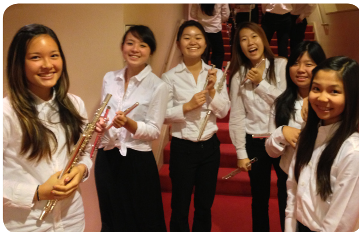
Flutists from Concert Orchestra pose before demonstrating their instruments to kids